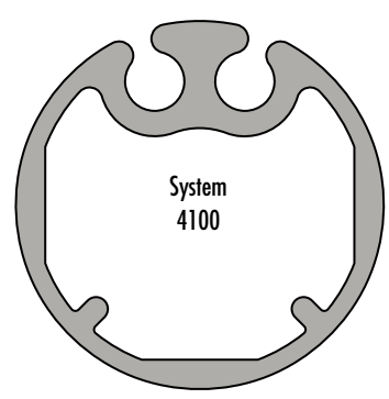
All extrusions shown full size.

Large diameter drum in System 3100 increases the power to reef large headsails in heavy winds. Low-friction bearing inserts eliminate metal-to-metal headstay contact for less noise and easier turning. Stainless heli-coil inserts insure that you'll be able to take the furler apart, even after years in salt water